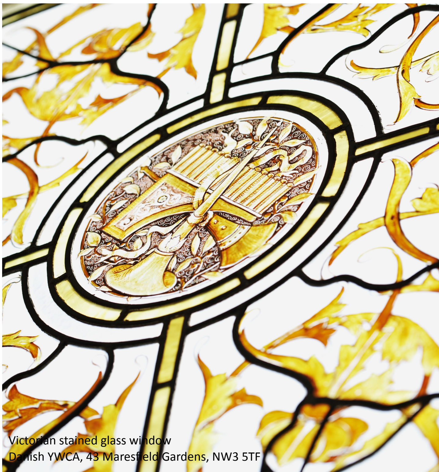
Victorian stained glass window Danish YWCA, 43 Maresfield Gardens, NW3 5TF