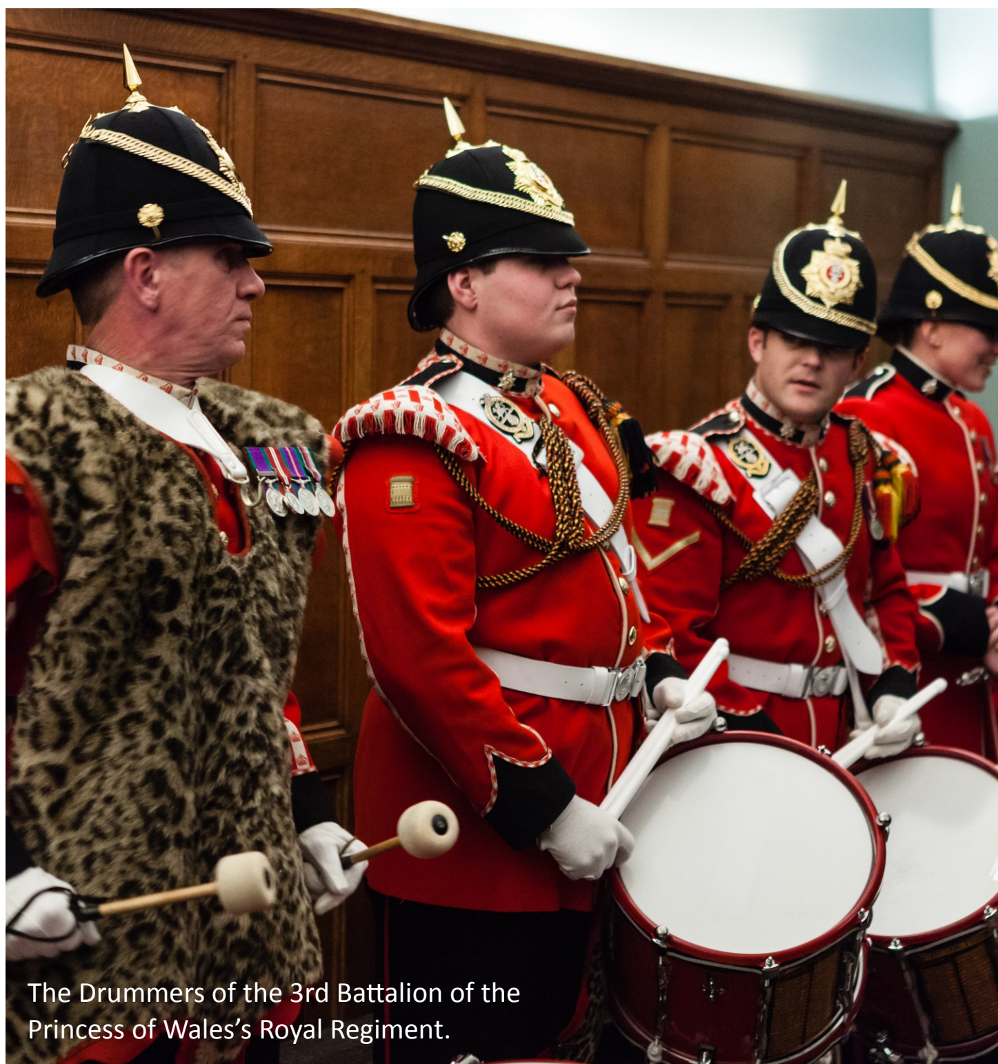
The Drummers of the 3rd Battalion of the Princess of Wales's Royal Regiment.