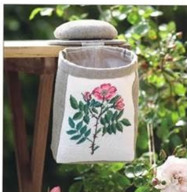
DESIGN AF LISBETH ROUM-MØLLER