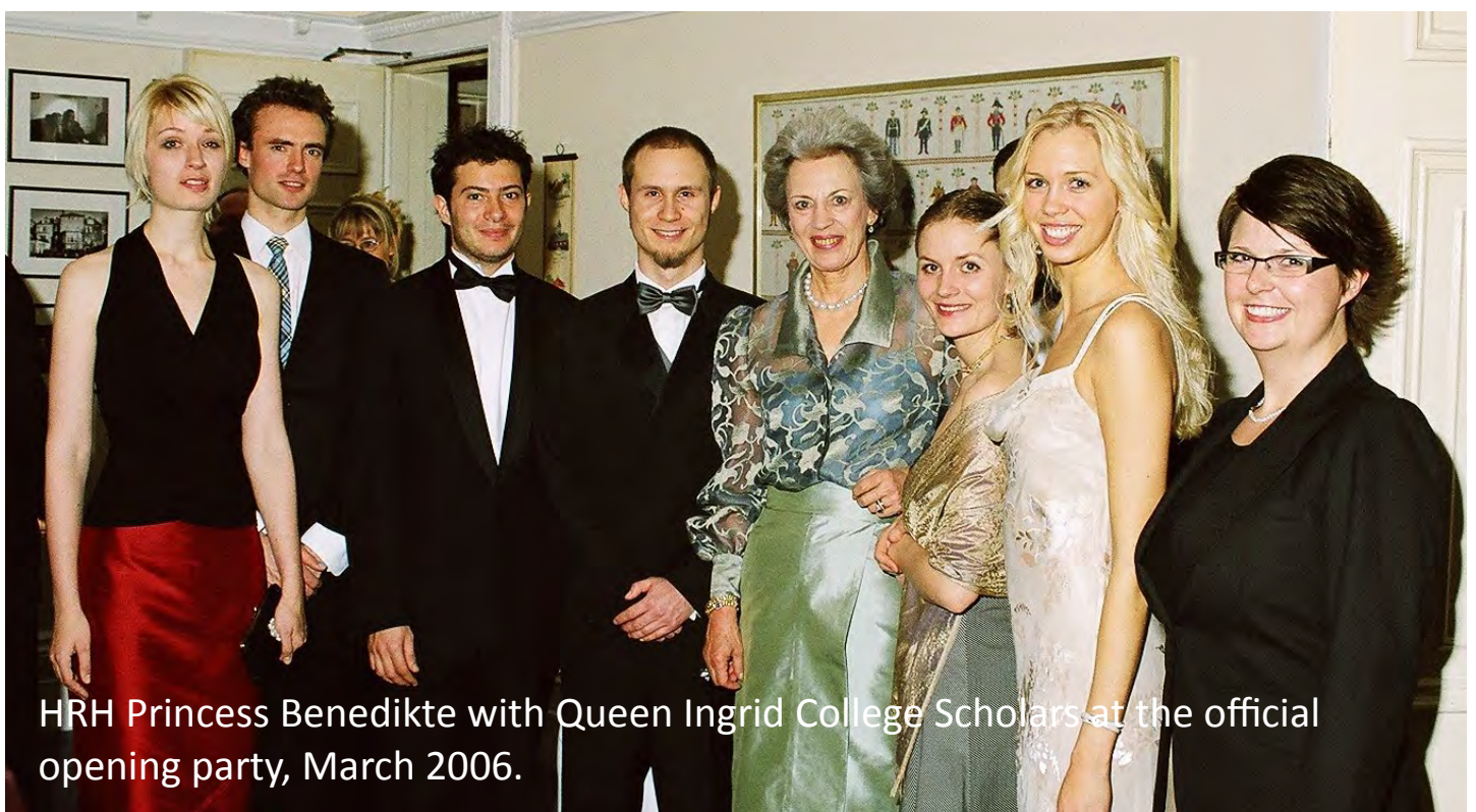
HRH Princess Benedikte with Queen Ingrid College Scholars at the official opening party, March 2006.

The first step was an 'opinion poll', conducted amongst Danish universities, to find out how many of their students went abroad as part of their studies. The survey showed that in