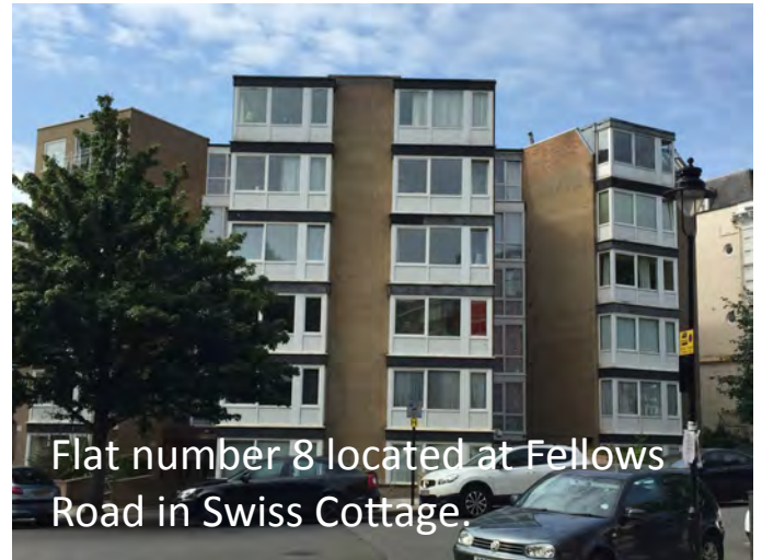
Flat number 8 located at Fellows Road in Swiss Cottage.

It was quite a blow! But we still had our first fund-money plus other funds had shown interest.