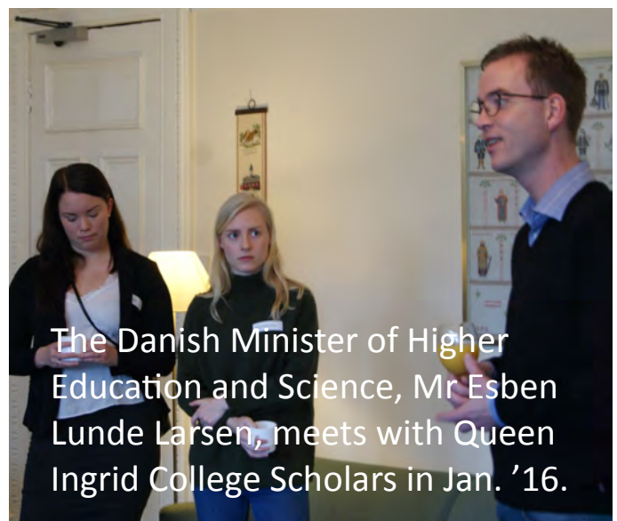
The Danish Minister of Higher Education and Science, Mr Esben Lunde Larsen, meets with Queen Ingrid College Scholars in Jan. '16.