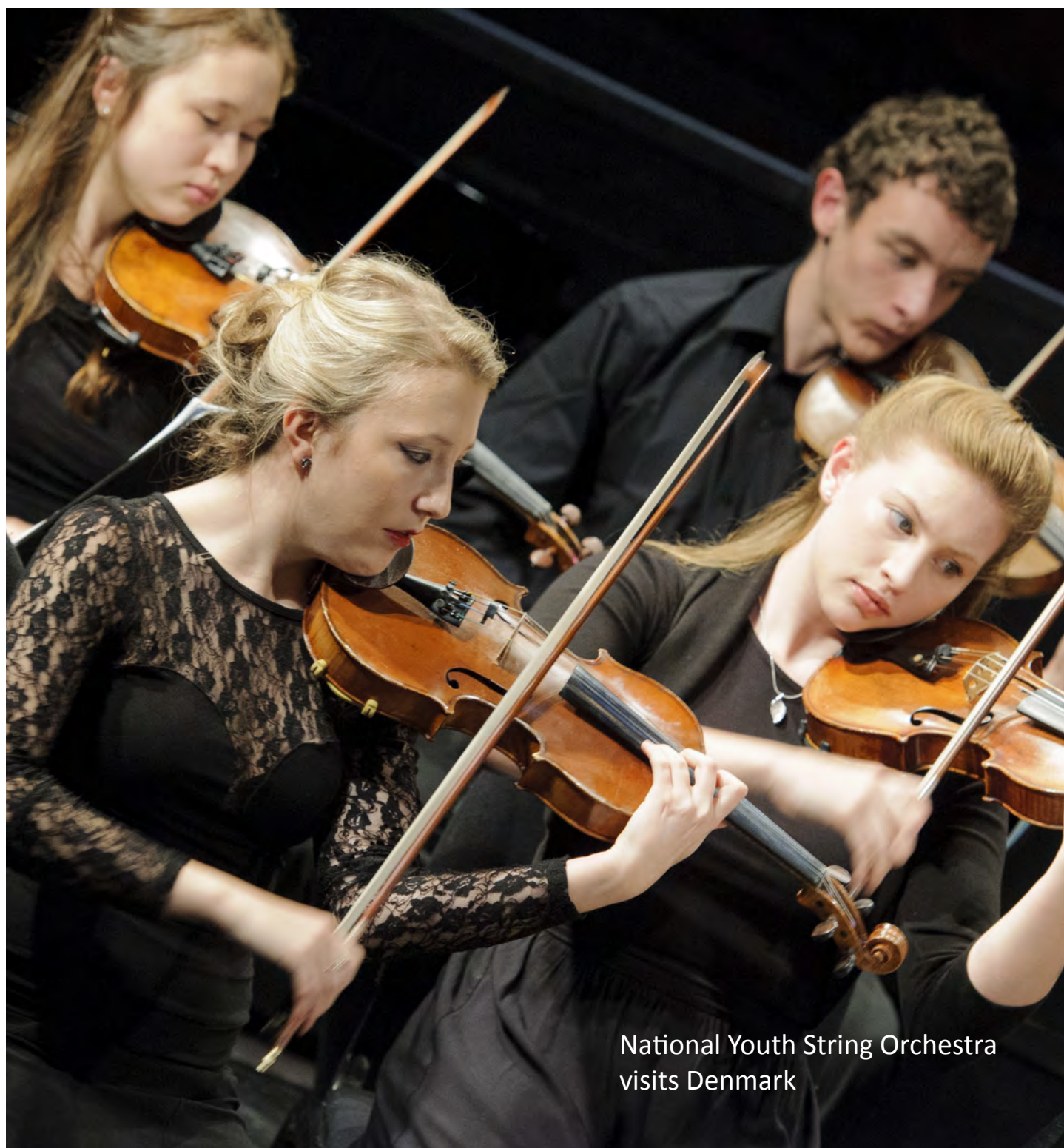
National Youth String Orchestra visits Denmark