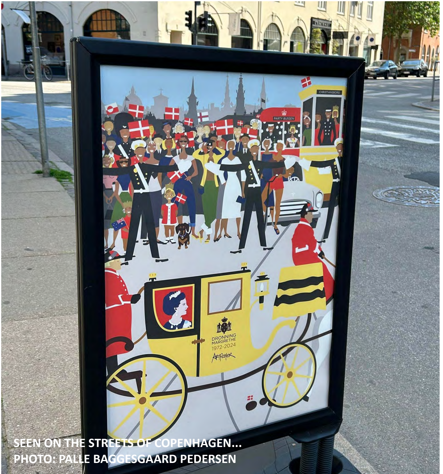
SEEN ON THE STREETS OF COPENHAGEN...